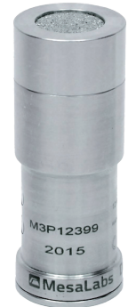
MPIII Pressure Data Logger