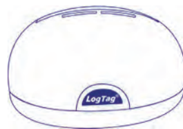
LTI-HID Not Included