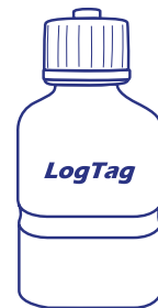
Glycol Buffer Not Included