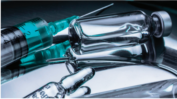
Vaccine & Pharmaceuticals