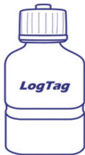
Buffer Assembly Not Included (Silica sand recommended for temperatures below -40°C)