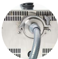
Hose Adaptor Connectors

The 6D can also be used for testing positive pressure systems using an optional positive injection pump (PIP) and hose adapter. On-site routine maintenance is easy. And its integrated compressor makes implementation simple - all you need is a power source.