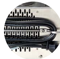
Power Cord Storage