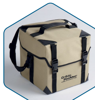
4 LITRES PAYLOAD