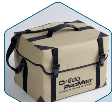
8 LITRES PAYLOAD