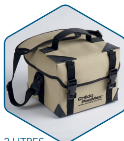
2 LITRES PAYLOAD