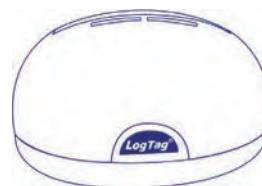
LTI HID Not Included