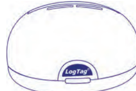
LTI-WiFi Not Included