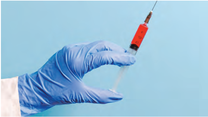
Vaccine & Pharmaceuticals