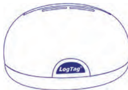
LTI-HID Not Included