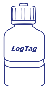
Buffer assembly Not Included