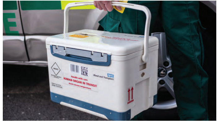
Blood & Organ Transport