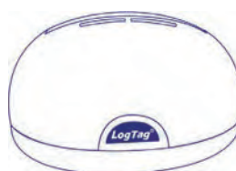
LTI HID Not Included