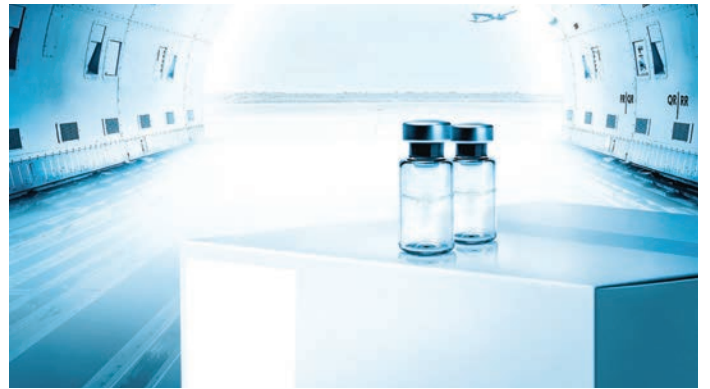
Vaccine Storage & Transportation