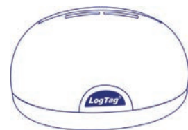
LTI-HID Not Included